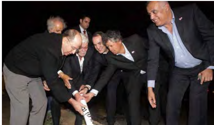
Minister of Defence Lt. General (res.) Moshe (Bogie) Ya'alon at the Ground Breaking Ceremony