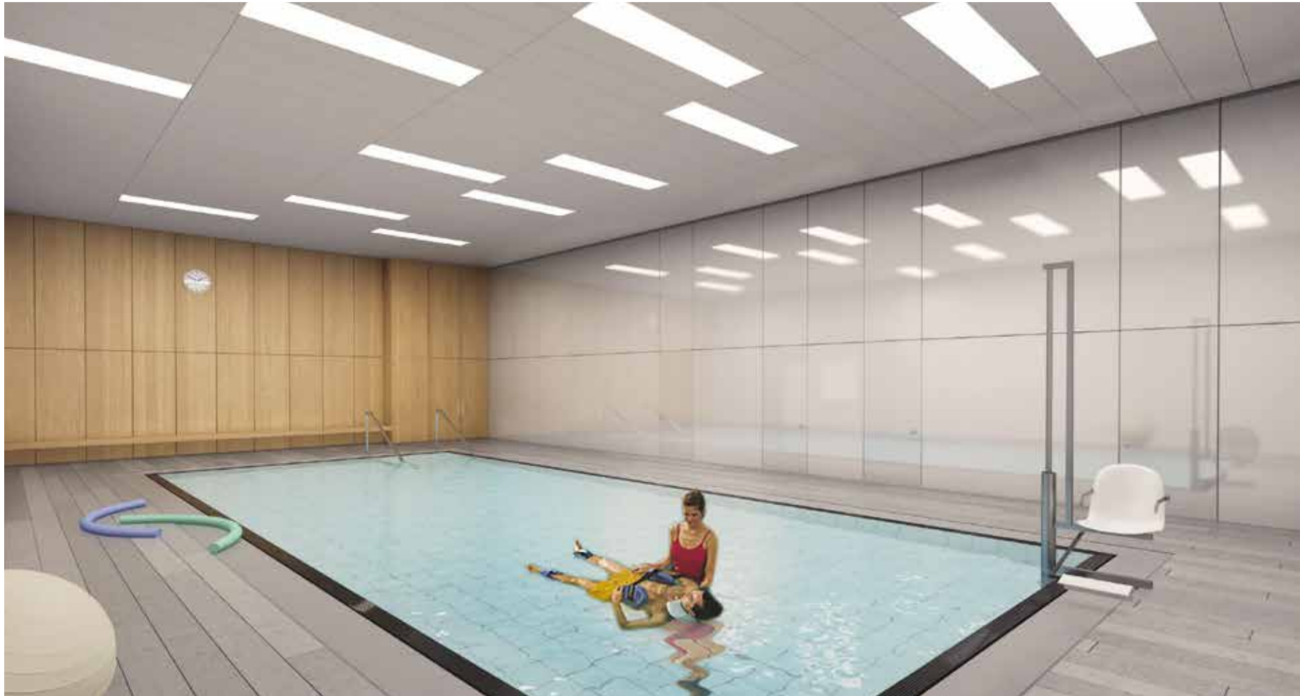
Hydrotherapy Treatment Pool *