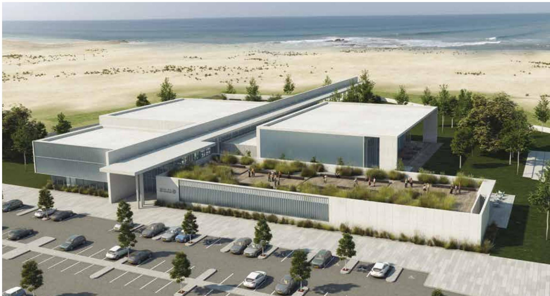
Beit Halochem Ashdod * / Moshe Zur Architects & Town Planners Ltd.