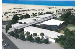
Future center - Ashdod

To make a tribute gift, please call 212-689-3220 or visit www.fidv.org . Thank you.